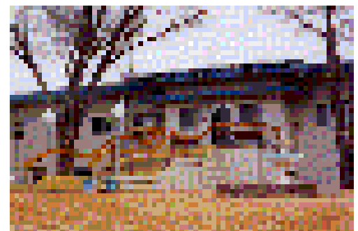
Lincoln Community Hospital

Additional staff and services, including social work, home health, telemetry, ultrasound, and CT scanning have helped to support the increasing patient utilization. Computers were upgraded with new hardware and software to comply with HIPAA regulations, allow for backup capabilities and improve communication and information technology. The hospital has also implemented additional services such as laparoscopic surgery, bone densitometry and MRI. Construction on a new nurses station has been completed and a new call system added. The hospital plans to provide Nuclear Medicine by late July 2004.