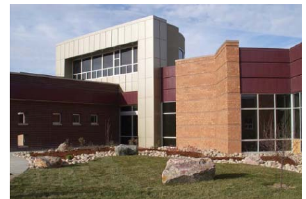
Melissa Memorial Hospital