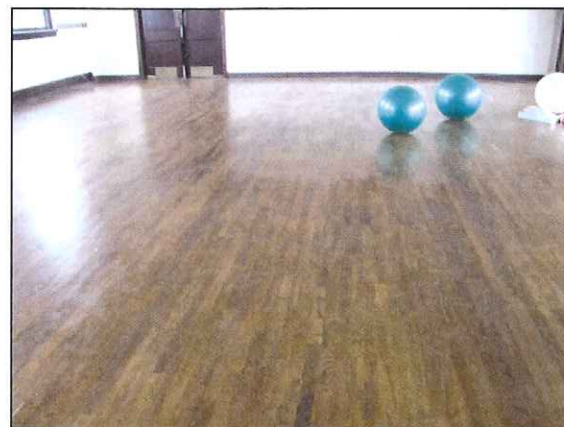
The solid oak floors are simply beautiful and provide a great place for Karate and Wii Fitness. Community members are excited to begin using the facility.