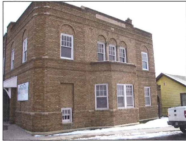
The bricks and windows have a new shine!