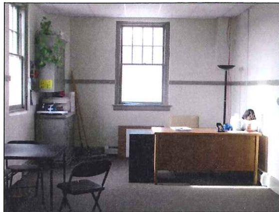
This is the same room before and after. It is the new after school Health program director's office.