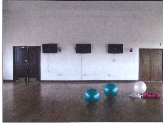
The "Ballroom" evolves!!