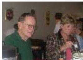
Attendees in Akron

CRHC, through the generous funding of the Adolph Coors Foundation, created the Feeding Our Rural Communities (FORC) program. The FORC program was created to strengthen programs that provide food to people in rural communities. Through this grant from the Adolph Coors Foundation, CRHC was able to bring food program folks together to gather and coordinate with one another.